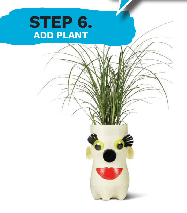
Once your planter is dry, add soil and a plant. Watch it grow!