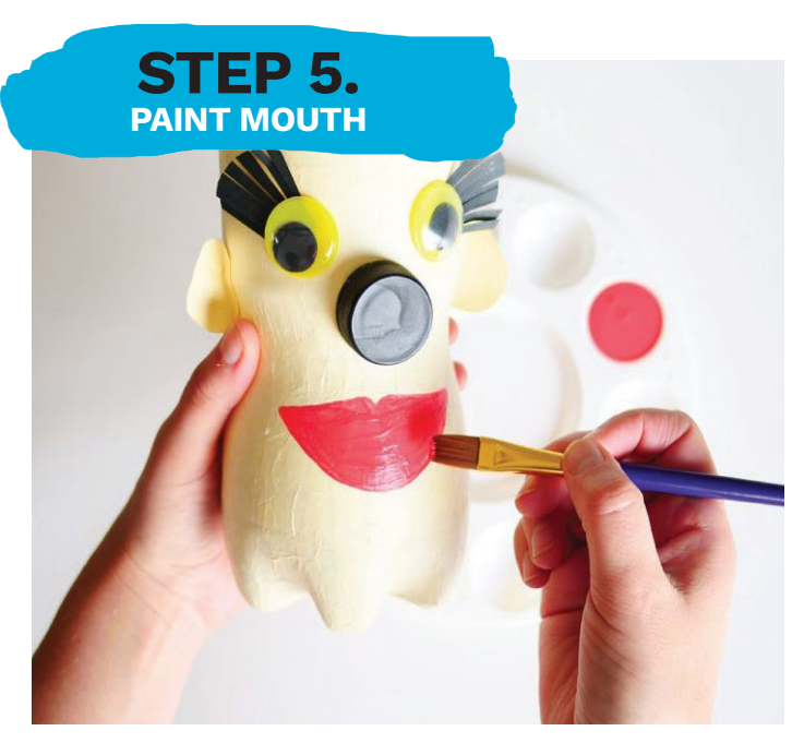
Paint a red mouth. Leave to dry.