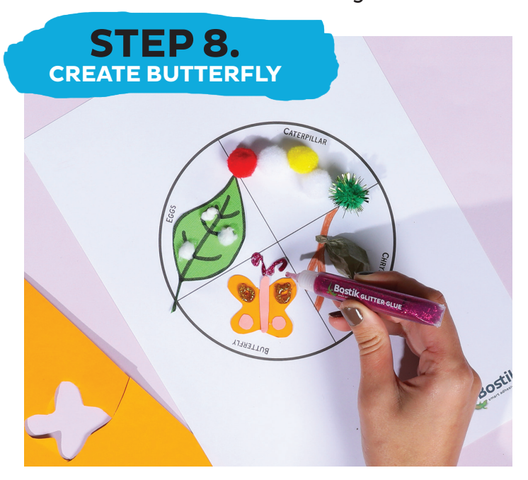
Decorate with glitter glue and create the antennae.