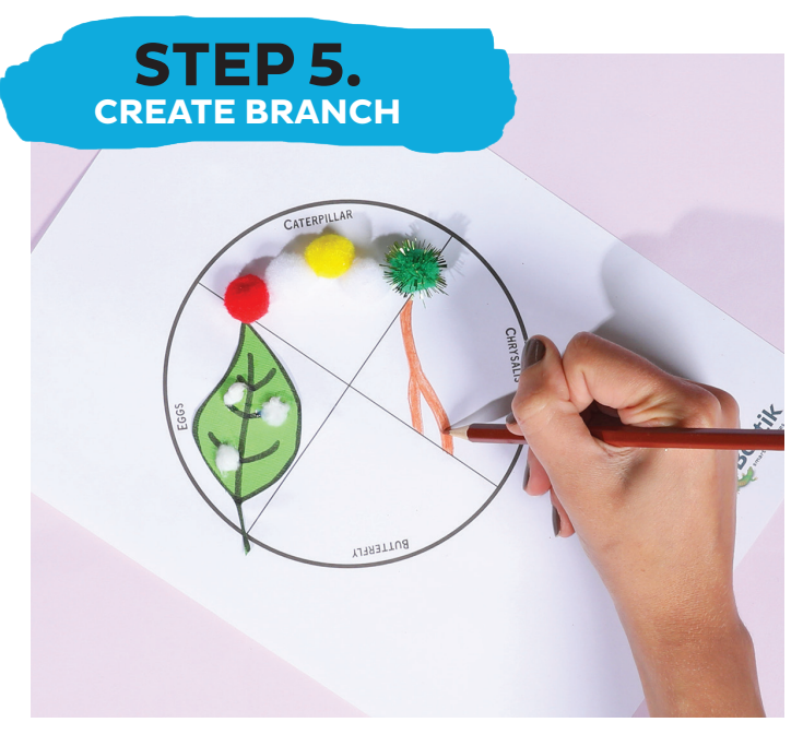
Draw a small twig onto the STAGE 3 section.

DON'T FORGET TO DECORATE YOUR BUTTERFLY!