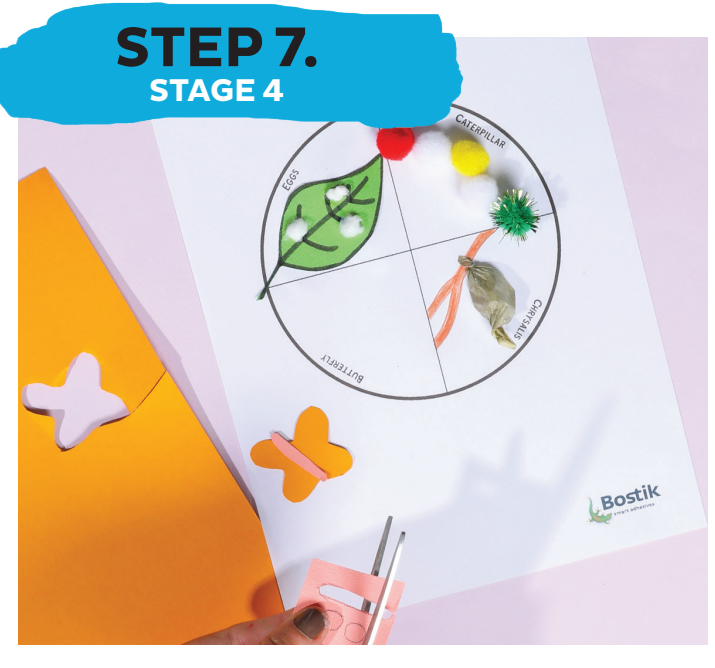
Cut out butterfly shape and paste onto STAGE 4 of your template.