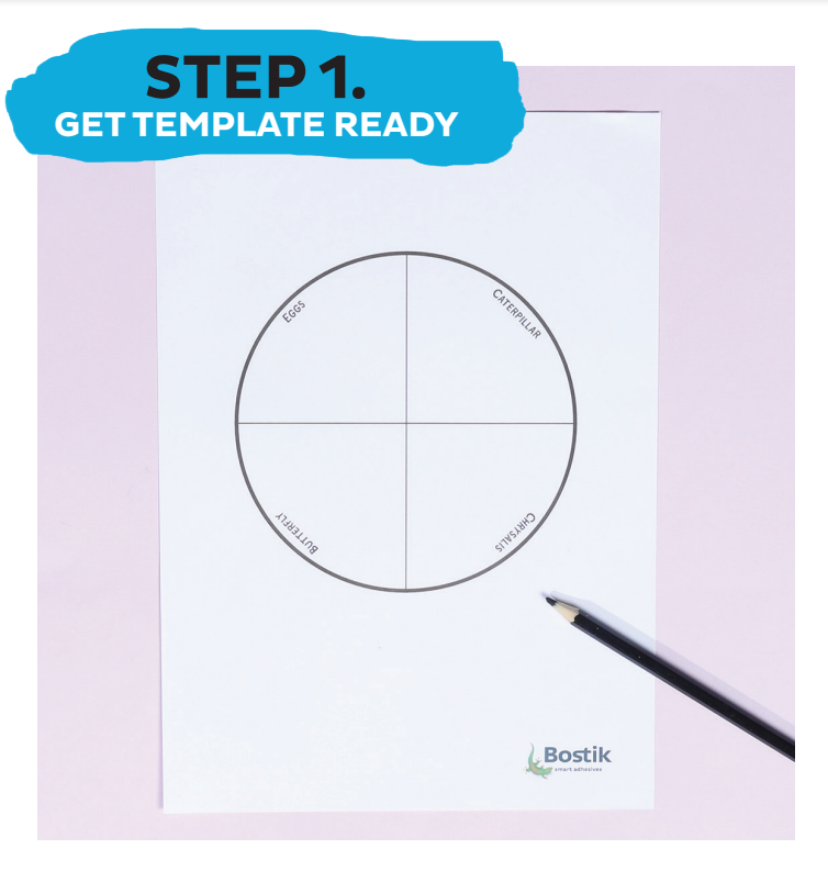
Print out the life cycle template... or draw your own!