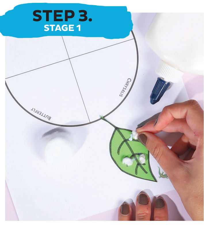
Tear a cotton ball into smaller sections and stick on the leaf to create eggs. Glue your creation onto STAGE 1 of the template.