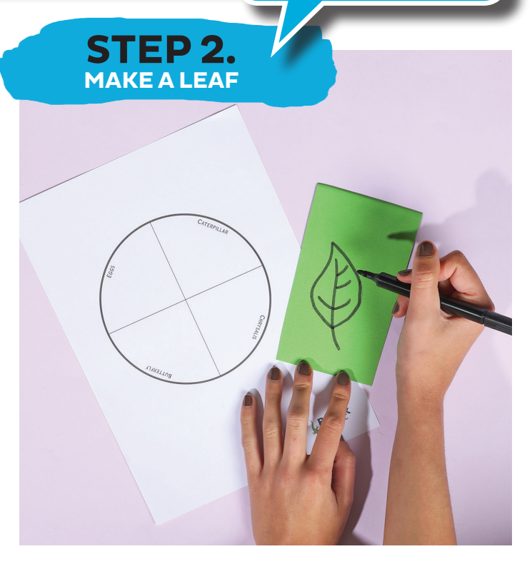
Cut out a small leaf from your green construction paper and draw lines with a black pen.